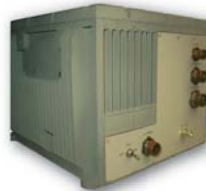
DGPS Ground Station