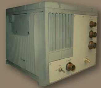
DGPS Ground Station

Dual-Thread Automatic Takeoff and Landing System