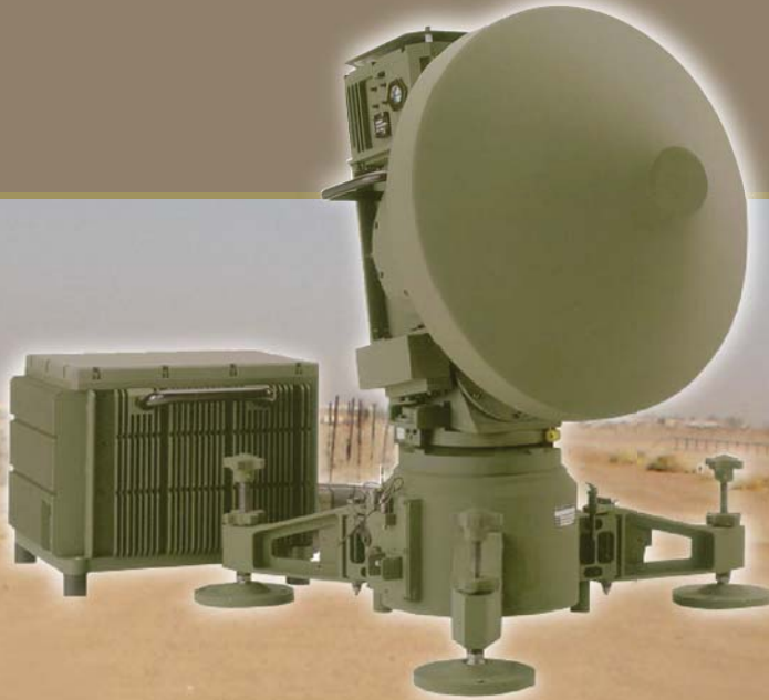
MMW Tactical Automatic Landing System