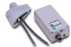
Airborne Transponder Subsystem